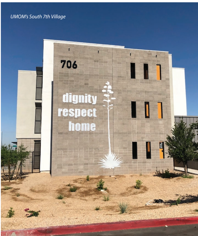
UMOM's South 7th Village

First Place continues its longstanding relationship with the Foundation for Senior Living (FSL) with the opening of a second intergenerational affordable housing property integrating autistic adults with seniors. Some residents live at Spectrum Courtyard (opened in 2021) and 29 Palms, both in Phoenix.